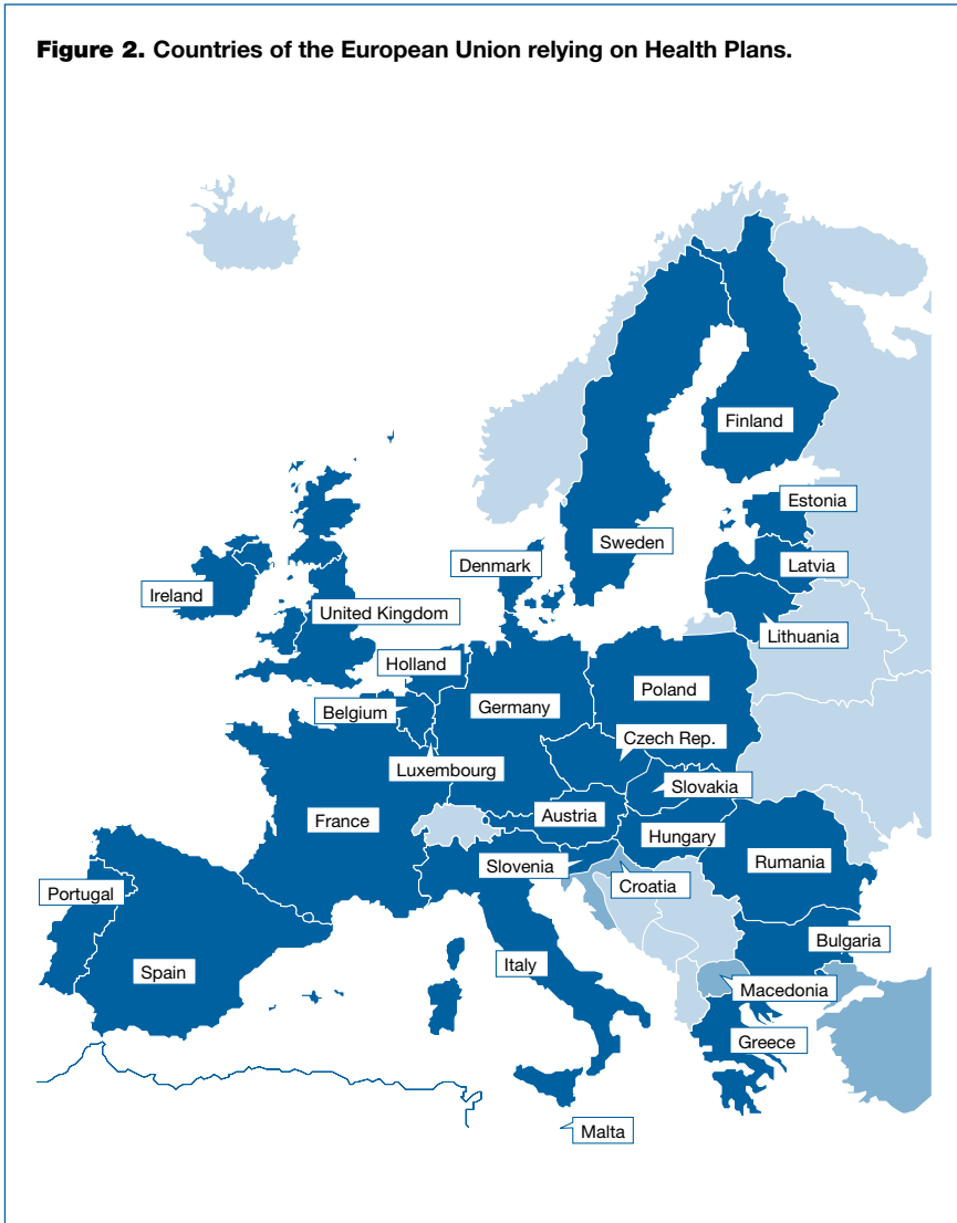
Figure 2. Countries of the European Union relying on Health Plans.